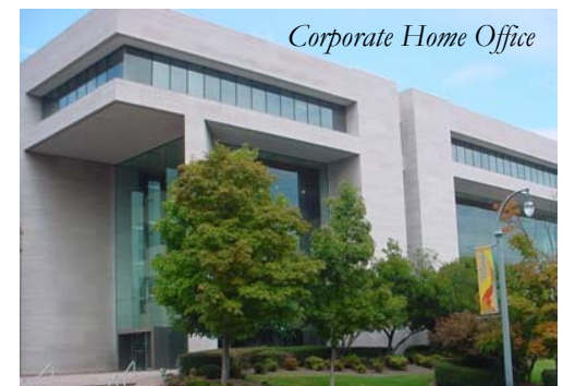
Herndon Plaza Atlanta, Georgia